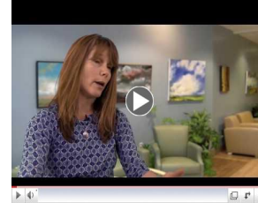
The Shared Care Conference