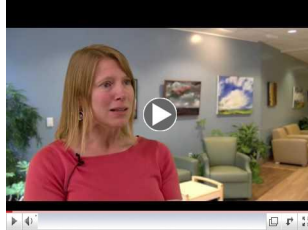
The Role of the Lead Care Coordinator