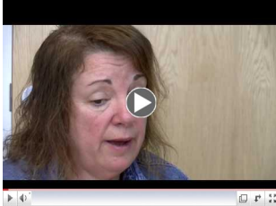
Identify Patient Goals